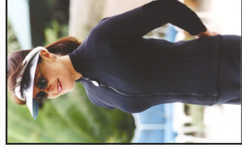
"Stretch Neo" Jacket (102) & Shorts (201) "Take Two" Vinyl Visor